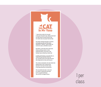
HEARTBEAT POSTER Demonstration