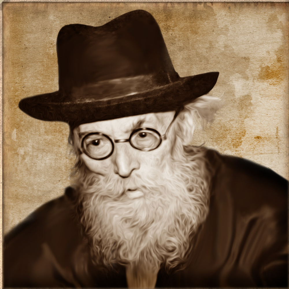
הרב אברהם ישעיהו קרליץ 1878-1953 The Chazon Ish