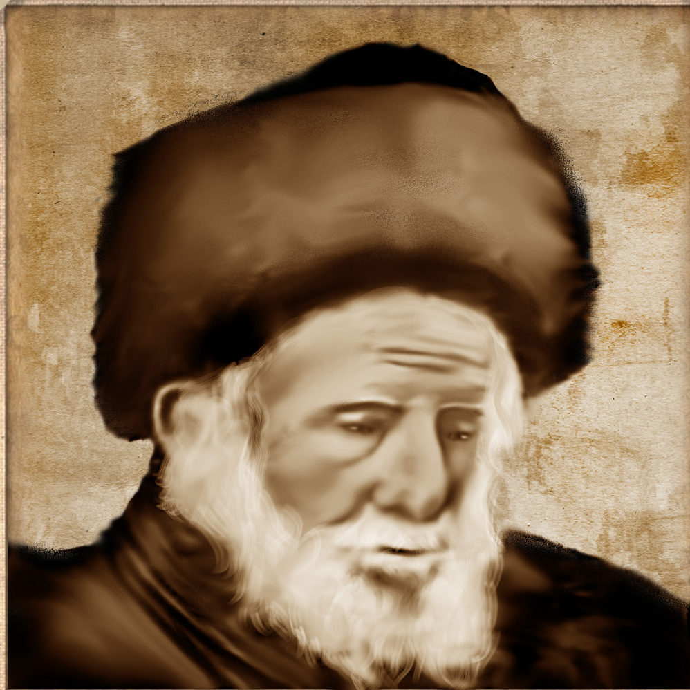
הרב שמואל סלנט 1816-1909