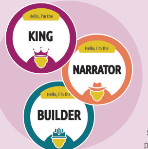
'THE LAST HOUSE' POEM Activity