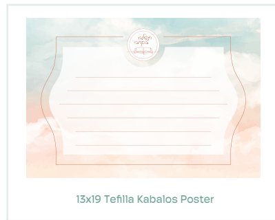
13x19 Tefilla Kabalos Poster

The Tefilla Kabalos Poster is used for the class davening kabalos (looking inside by specific sections, having certain kavanos in mind...). Laminate the poster and use an erasable marker to update weekly. Kabalos can be culled from student suggestions.