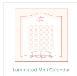
Laminated Mini Calendar

Students keep track of their progress on the laminated mini calendar which can be glued to the bottom of the box or kept inside as the top card. Incentives are given at the end of the week (a mini card with a Passuk), or a monthly incentive can be given based on how many points were accumulated.